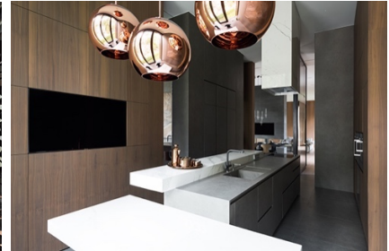
Furnishing & Design