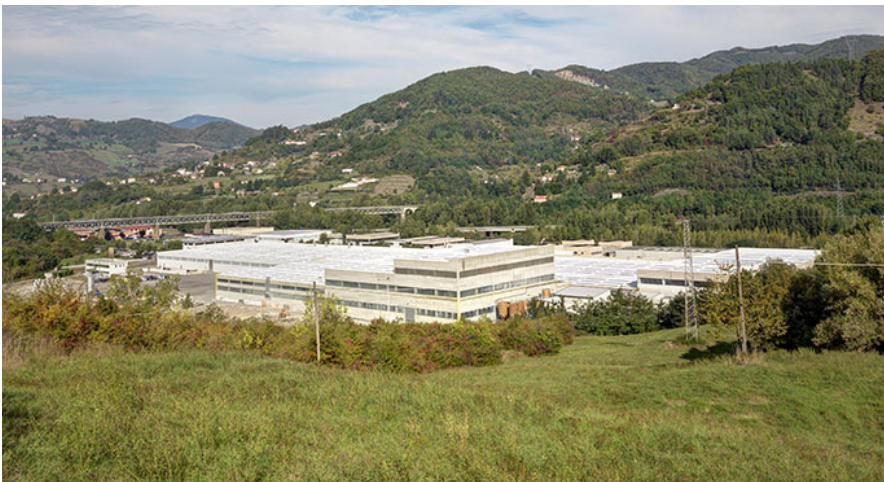
Borgo Val di Taro