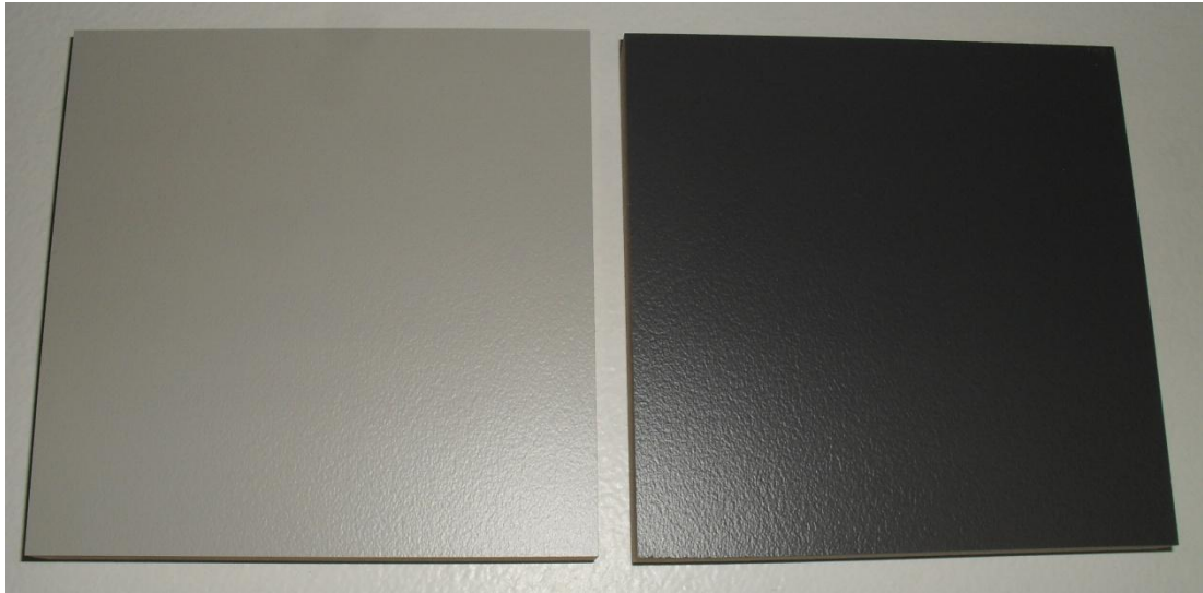
Figure 1 Representative specimens (exposed face of “Seal Grey” on left, “Storm” on right)

The product submitted by the client for testing was identified by the client as Melteca, a low pressure melamine (LPM) on MDF comprising melamine saturated paper laminated to both faces of nominally 12 mm thick MDF. Figure 1 illustrates a representative specimen of that tested.